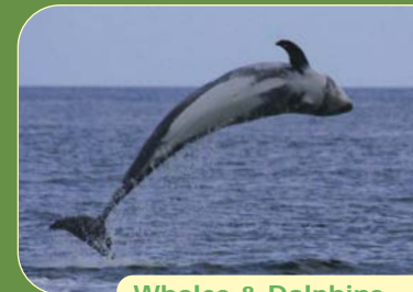
Whales & Dolphins